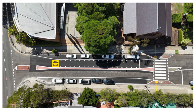
Completed safety infrastructure with refuge islands and traffic calming