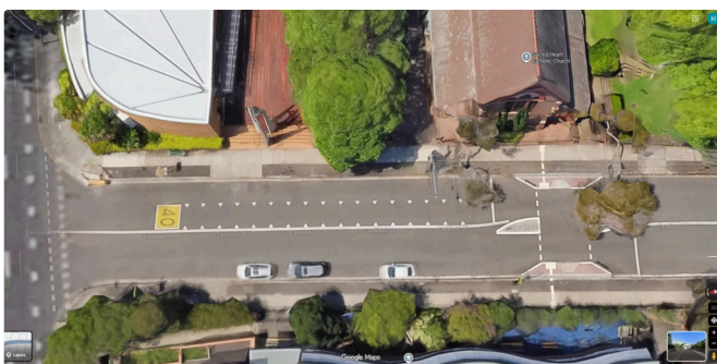
Cardinal Street prior to safety improvements