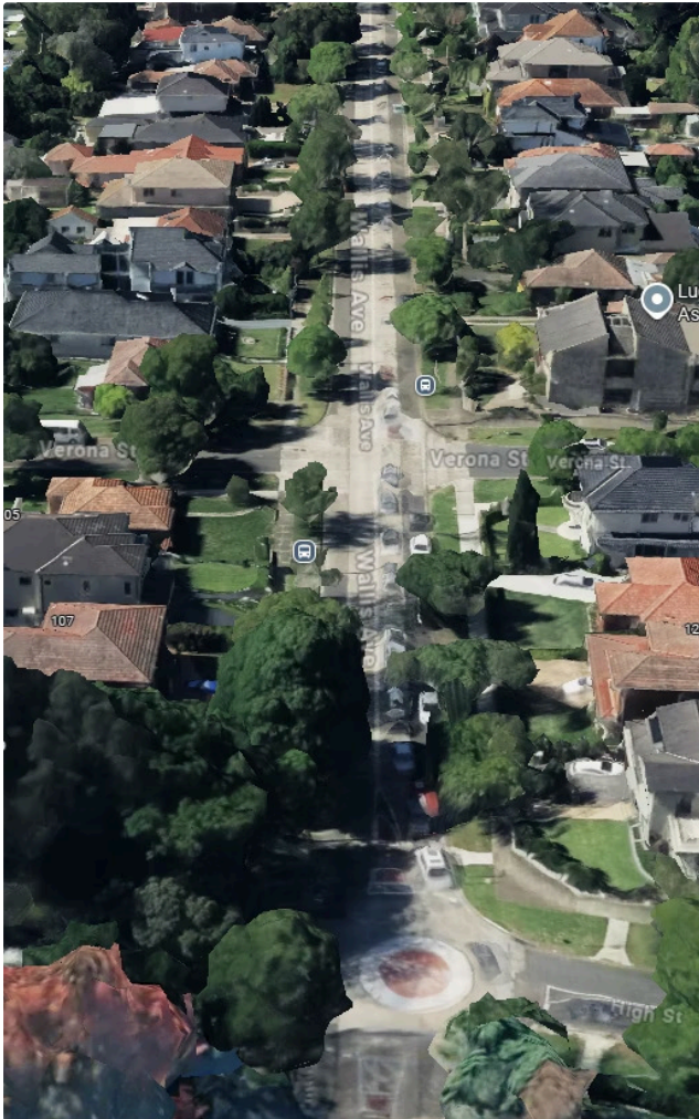
Pre-works condition – deteriorated pavement and aged infrastructure