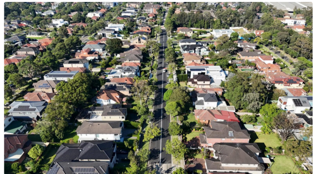
Post-works – reconstructed pavement, new asphalt and restored infrastructure